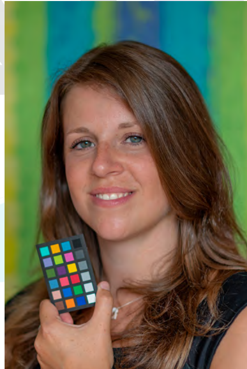
After Kolor-D processing