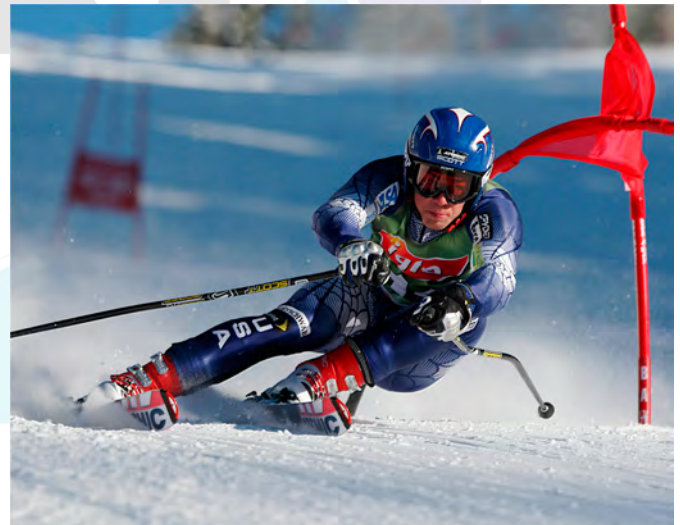
After Kolor-D processing